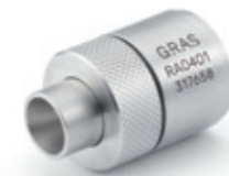
RA0401 Externally Polarized High Resolution Ear Simulator