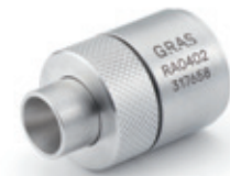
RA0402 Prepolarized High Resolution Ear Simulator